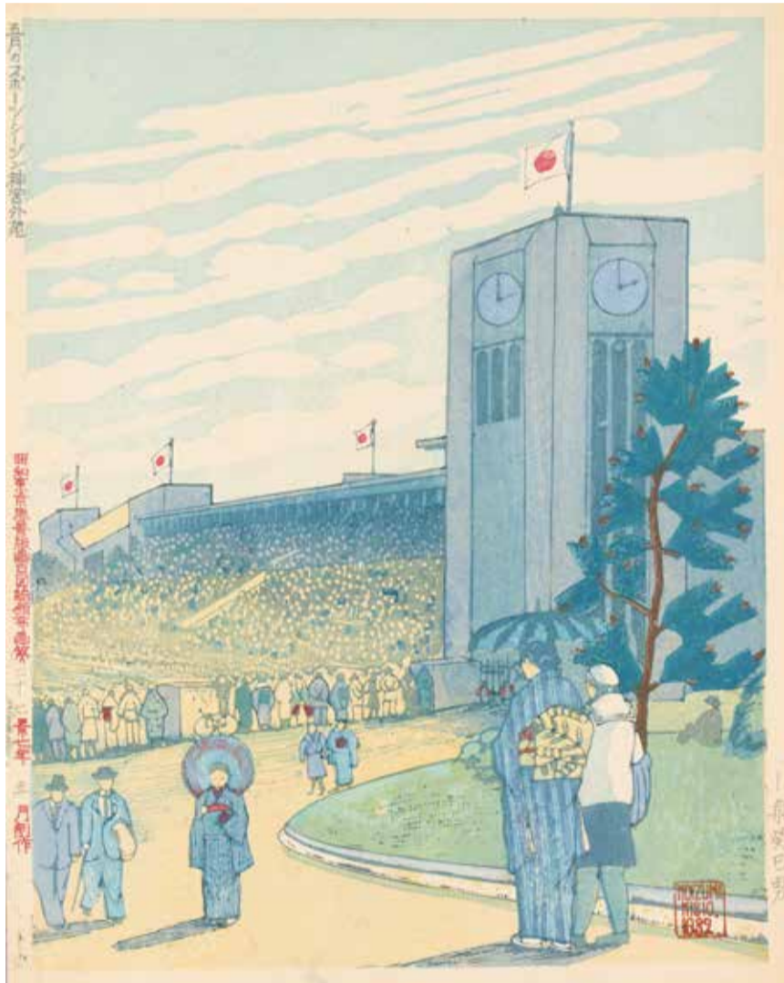
One Hundred Scenes from the Tokyo Metropolis in the Showa Era, No. 27, The May Sports Season, Jingū Gaien By Koizumi Kishio, 1932