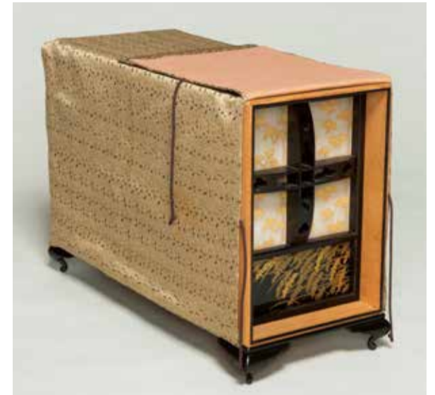
Cage Container, Ebony Latter half of Showa period

how to raise uguisu and how birdsong competitions were held. The cage container shown here was made in the Showa period (1926-89) but follows the forms shown in that book. The cage container held not only held the cage and the bird but also was made with wavy interior walls, so that the bird's voice would reverberate more strongly. The lavish decoration of its hatch gives us a sense of the craftsmen's skills at that time as well as the devotion of the enthusiast to this hobby.