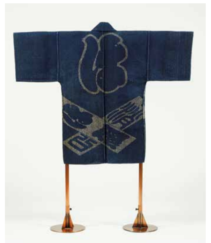
Sashiko Quilted Hanten, worn by the head of a local fire brigade Late Edo period

Motifs that invoke the idea of water were popular decorations for these jackets. Both the outside and inside of the jacket are this perfectly appropriate for a member of a local fire brigade.