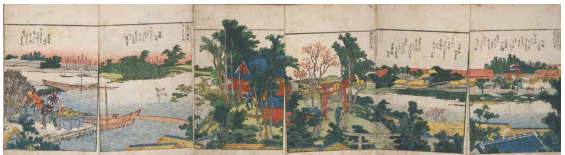
Picture Book: Panoramic Views of Both Banks of the Sumida River By Katsushika Hokusai, Tsuruya Kiuemon, publisher.