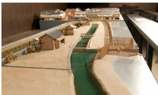
5F Permanent Exhibition Area – The Tamagawa Waterworks and guard house at Yotsuya Ōkido / model

The Tamagawa waterworks delivered water throughout the city of Edo from Tamagawa River, flowing across the Musashino Plateau for around 43km before running underground through wooden conduits to reach all Edo residents. The fully manmade canal was dug completely by hand and despite the very small difference in elevation, the aqueduct assured a stable supply of water. It is a shining example of advanced technology in the early Edo period. The exhibit will inform you deeply of the Edo waterway that brought hydration to the people of the city.