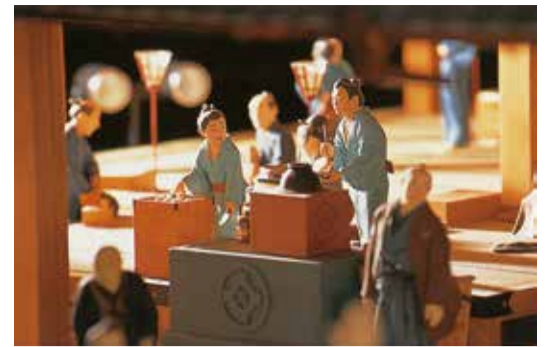
See the models in intricate detail Mitsui Echigoya Dry-Goods Store (model) * For details about the Permanent Exhibition Area 360° Panoramic View, please check the Museum website. https://www.edo-tokyo-museum.or.jp/p-exhibition

Enjoy places that visitors do not normally see such as the upper part of Festival Float of the Kanda Myōjin Shrine (model) and the interior of Area to the Western Bank of the Ryōgokubashi Bridge (model) via close-up video that makes you feel as if you are right there in person. Visit the virtual world of the Edo-Tokyo Museum Permanent Exhibition Area.