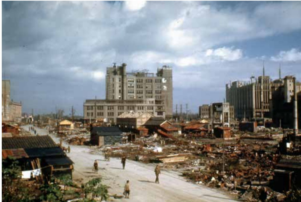
View of the East side (Mitsukoshi and Isetan Department Stores) from the Shinjuku Station 1945 (Shōwa 20)

5F Permanent Exhibition Area Feature Exhibition Room