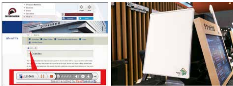
Left: Read Speaker screen Right: 1F General Reception Hearing Loop (magnetic loop)

The Museum website will feature Read Speaker reading software starting this spring. It can read aloud text in Japanese, English, simplified and traditional Chinese, and Korean.