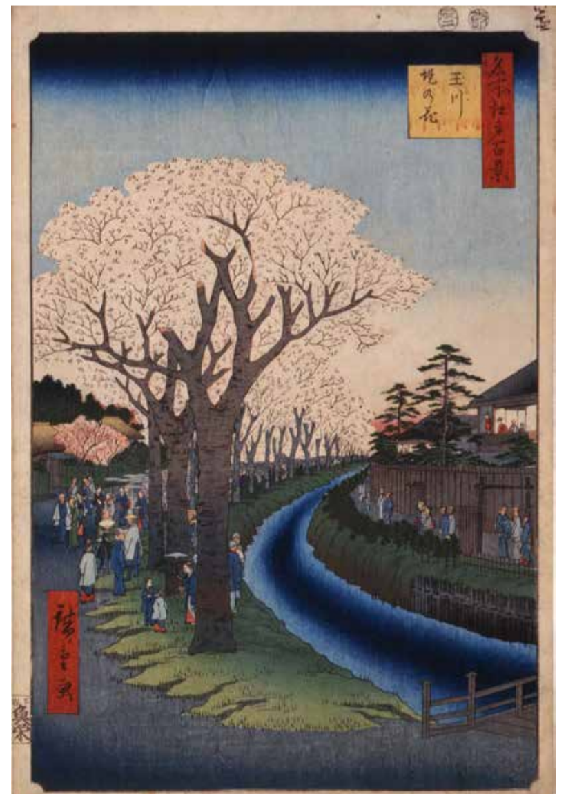
Cerry Blossom on the Banks of the Tamagawa Waterworks Utagawa Hiroshige 1856 (Ansei 3)