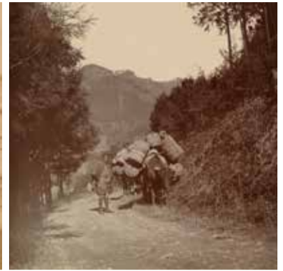
In the Mountains of Oume 1894-97 (Meiji 27-30)

Opening hours: 9:30-17:30 (9:30-19:30 on Saturdays).