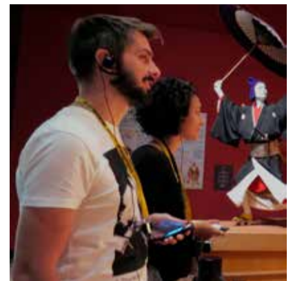
The receiver is light, compact and easy to use

The Audio Guide Rental Counter is found near the entrance to the 6F Permanent Exhibition Area. Make the most of this service.