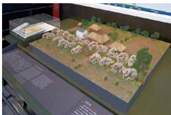
5F Permanent Exhibition Area – Tamagawa waterworks Basin / model