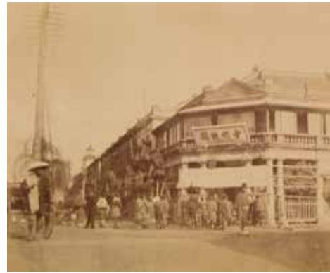
Special Edition Issued by the Ginza Chūō Newspaper Company